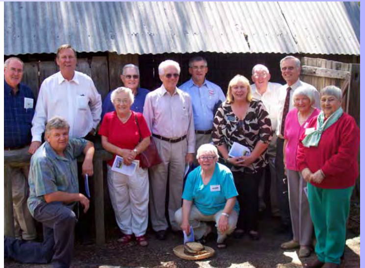
Mitcham Rotary and tour guides at Schwerkolt Cottage